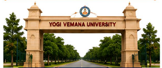
YOGI VEMANA UNIVERSITY (ANDHRA PRADESH)