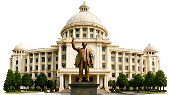
BABA SAHEB AMBEDKAR EDUCATIONAL UNIVERSITY (WEST BENGAL)

Empowering Educators, Transforming Tomorrow