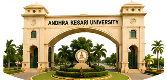
ANDHRA KESARI UNIVERSITY (ANDHRA PRADESH)